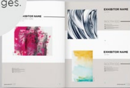
CATALOG PREVIEW EXAMPLE

A half-page or upgraded full-page exhibitor preview in our beautifully designed bound Show Catalog will capture attendees' attention.