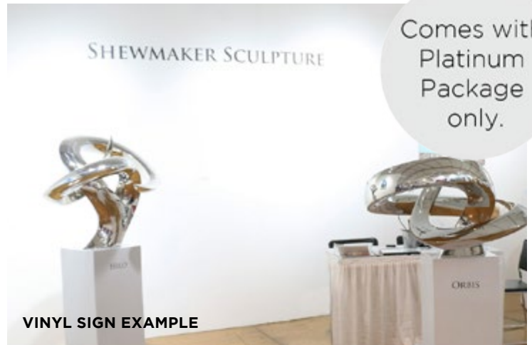
VINYL SIGN EXAMPLE

Booth signage that marks you out from the crowd is likely to attract more visitors, increase brand awareness, generate leads, and grow sales.