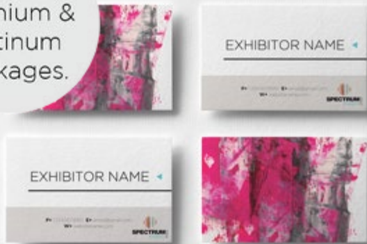
BUSINESS CARD EXAMPLE

An art show is about more than selling art. It's about making connections that last a lifetime.